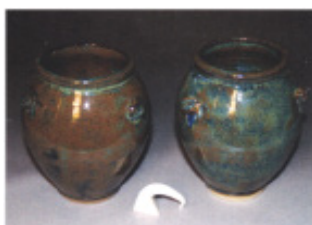
The same glaze can look different when applied on different clay bodies. Iron in the darker clay (left) reacted with the glaze and changed its color.