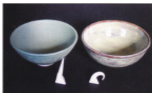
Many gloss glazes look matte (left) when underfired.

Great results are always what we hope for when opening the kiln after firing, but sometimes it just doesn't happen. Figuring out what happened can be difficult, but these tips might help answer some common questions.