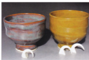
Some glazes that contain iron can change color if fired twice. The extended heat work changes the color and sometimes the surface too.