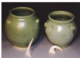
Some glazes look okay when underfired a little (on left), but create different effects when reaching their full temperature. (Sample Amaco glaze photos from Arts & Activities magazine, February 2015)