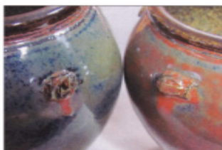
Same glaze: the left bowl had a thinner application and 14 hours firing. The right bowl had a thicker application and faster firing (9 hours).